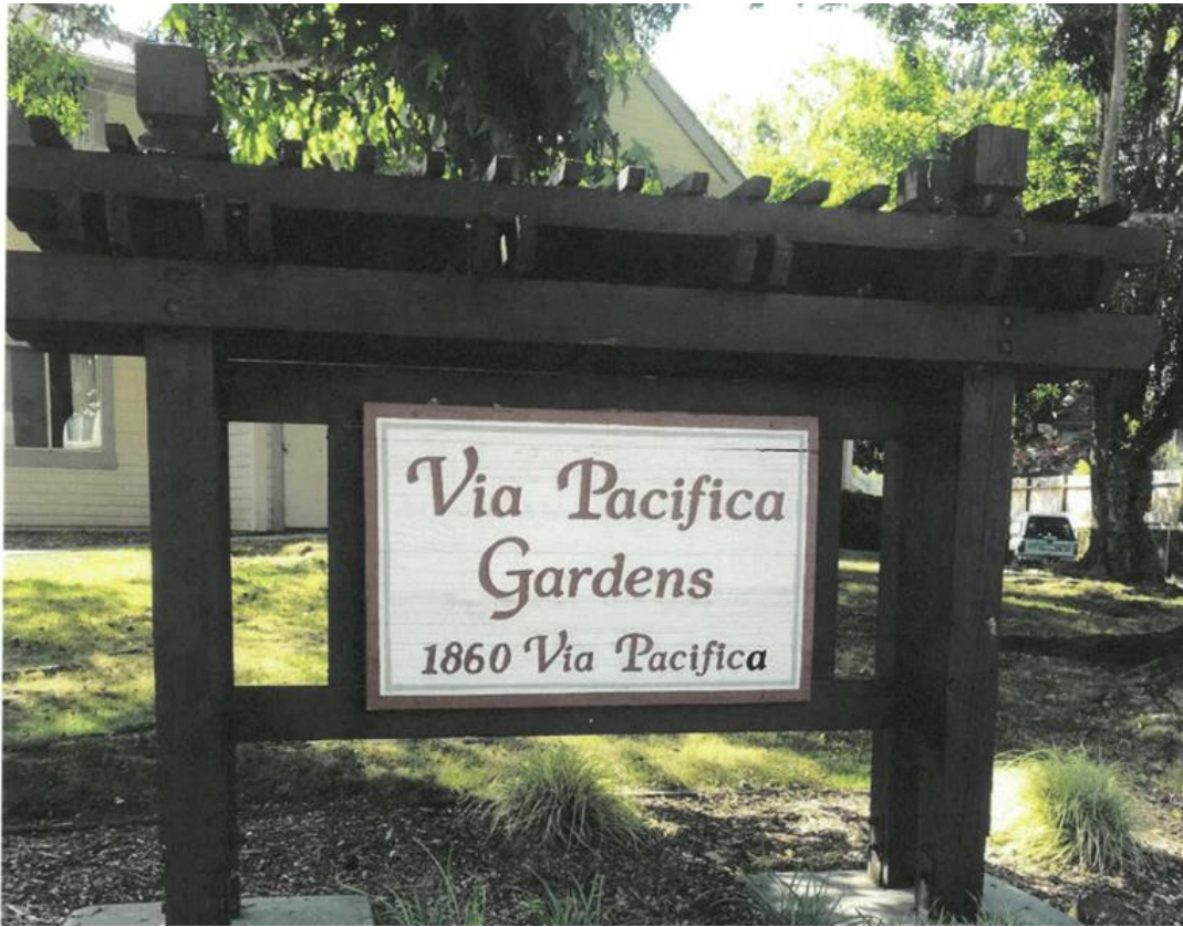
EXHIBIT 5C: PROJECT SIGN