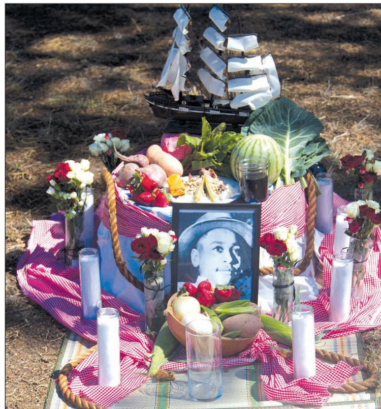
The rope is part of the altar for Omnia Institute's 'Ritual of Remembrance' Juneteenth celebration on June 10 at Lake Merritt.

Black people certainly knew who terrorized them. The memory of such horrors