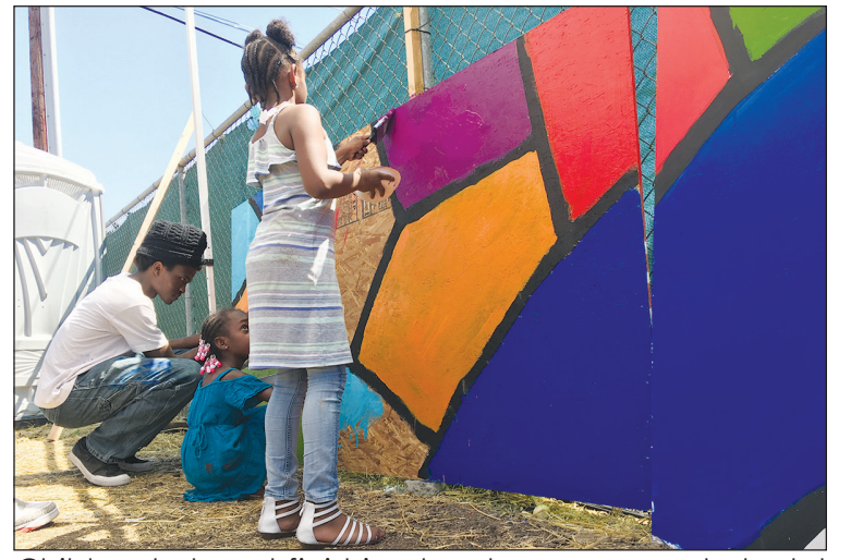
Children help put finishing touches on a mural at a lot at 75th and MacArthur Boulevard in Oakland.